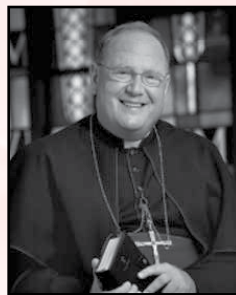
ARCHBISHOP TIMOTHY DOLAN